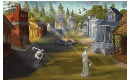
Camp Half Blood